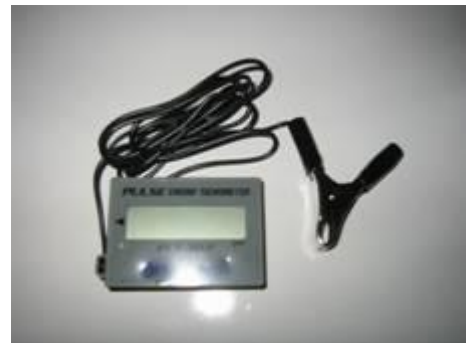
r.p.m. meter Item No. 9992124